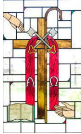
St. Titus, Pastor and Confessor

“Faith,” “the knowledge of the truth,” and “the hope of eternal life” are manifested daily among us in His Word through the preaching of the Gospel of Christ Jesus (Titus 1:1–3). The times seem desperate: “fierce wolves” are among us, “not sparing the flock” (Acts 20:29) and “the harvest is plentiful, but the laborers are few” (Luke 10:2). The Lord, however, is diligent to build and care for the Church “which he obtained with His own blood” (Acts 20:28). We are not to fear, but rather to “pray earnestly to the Lord of the harvest” (Luke 10:2). Send us faithful laborers! Preserve all pastors and teachers, that they “hold firm to the trustworthy Word as taught” so that they, like St. Titus, “may be able to give instruction in sound doctrine and also to rebuke those who contradict it” (Titus 1:9)! Give us ears to hear their preaching in repentance and faith. Preserve them from falsehood, greed, and unholy living. We commend them to You and the Word of Your grace (Acts 20:32), that “when the chief Shepherd appears,” (1 Peter 5:4) He may declare, “Well done, good and faithful servant. . . Enter into the joy of your master” (Matt. 25:21).